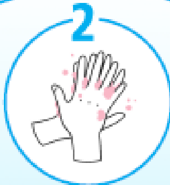
Backs of hands