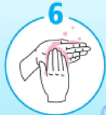
Tips of fingers

To help keep time, sing 'Happy Birthday' twice.