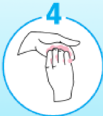
Backs of fingers